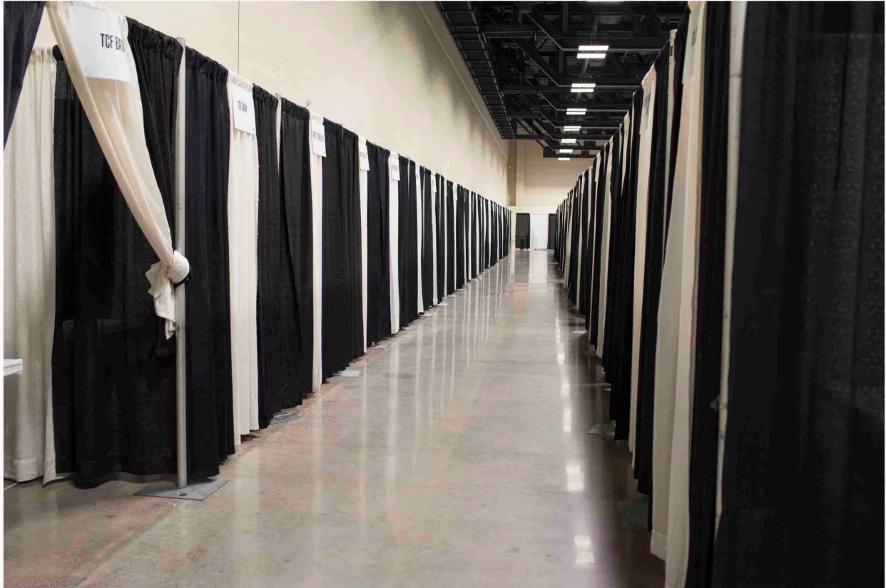
EXHIBIT HALL A