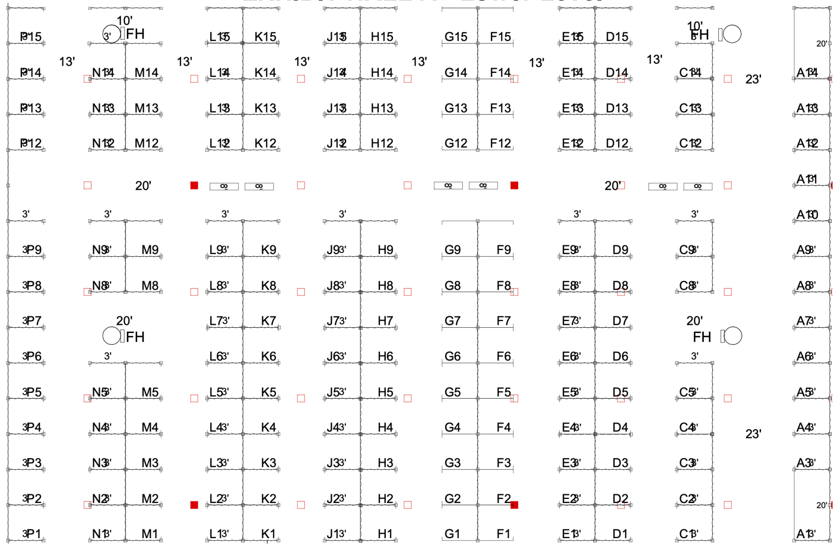
EXHIBIT HALL A - Lower Level

-Student Lounge -Student Check In -Student Coat Check